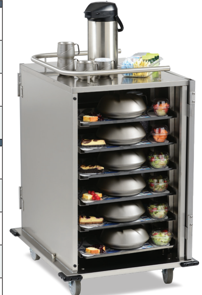
Model SC12S-525DPR with DPR Upgrade Package shown