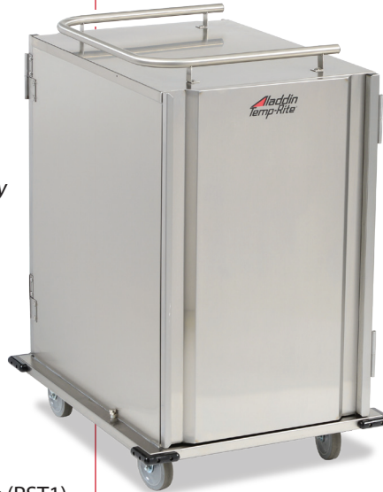
SC12S-525DPR Low-Profile Model with DPR Upgrade Package shown

NEW Accessory! On-Board Beverage Caddy Only from Aladdin!