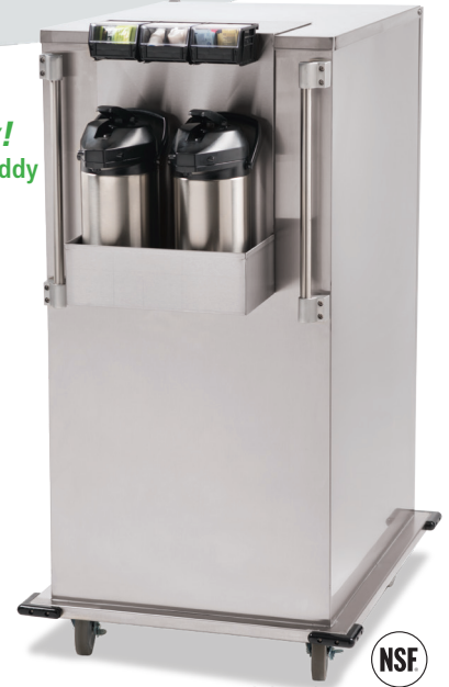
SC16S-525 Model with Beverage and Condiment Caddy shown